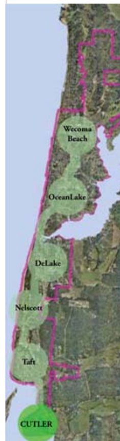
Map of Lincoln City, Oregon, showing the 'String of Pearls'.

In 1999, the Taft District was the first selected to participate in the Urban Renewal Plan and Program to establish a community vision. The OceanLake District Vision Plan was then conducted in 2001, followed by the Nelscott District in 2006. All three projects relied heavily upon public involvement and outreach, beginning with a week-long visioning process that included numerous design workshops, community walks, interviews, and focus groups. There were also follow-up public workshops and meetings, project information centers, project websites, newsletters, and the development of distinct district logos. Past visioning efforts in Lincoln City have been nationally recognized for community involvement.