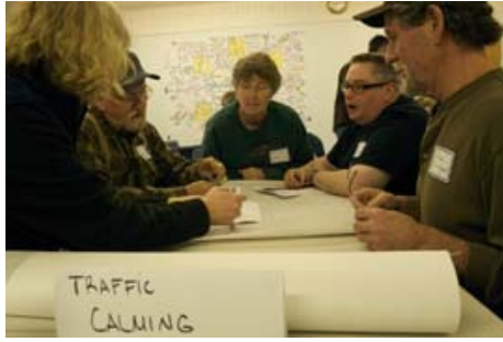
Community members discuss concerns in the Cutler District during a community workshop.