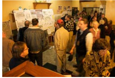
Community members view renderings of ideas for the Cutler District.