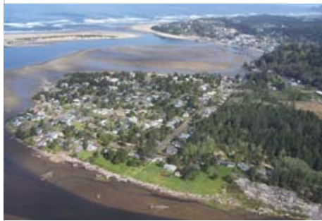
A view of the Cutler District.

Primarily a residential neighborhood with longstanding commercial establishments along Highway 101, Cutler is the most recent "pearl" on the list for Lincoln City Urban Renewal. This district serves as the southern gateway entering or departing Lincoln City. Historically called Cutler City, the district has long been known for its strong community spirit, peaceful Siletz Bay, and its lush gardens. It was once even dubbed the "Wild Rhododendron Capital of the Oregon Coast." In past years, the Cutler community has come together to build its first fishing dock at Gibbs Point, worked to protect homes from harsh winter storms by constructing sea walls and dikes, repaired streets by bringing in gravel from nearby Drift Creek, and even built a community hall for neighborhood meetings and special events. The Cutler District is a hidden pearl, rich with character and charm.