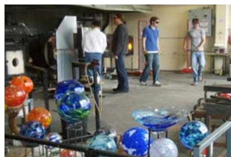
Design team members create their own Lincoln City souvenirs before heading home.