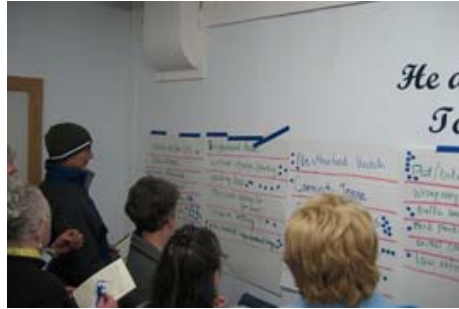
Community members place dots on issues of highest concern at a community meeting.

Touching base with the community prior to the vision charrette gave the design team upfront information about residents' concerns and wishes. This information was gleaned at a community issues and values meeting at Cutler Community Hall several weeks before the five-day visioning event began. During this meeting, a list of community characteristics to be preserved, enhanced, and optimized was created. People voted on their highest concerns with sticker-dots so that a ranking of priority items could be determined. A focus meeting for property and business owners along the highway created a separate list of items needing attention in that area of Cutler. This helped the design team quickly understand where its energy should be focused during its working time and the community charrette, and allowed the team to hit the ground running.